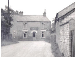
The Hopbine public house – 1950s