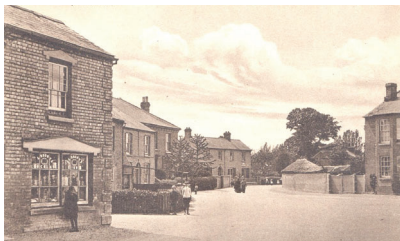
The Chocolate Box run by Mrs Hazel

The Chocolate Box general store. Now the Village Stores and Post Office.