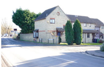
Station Road/Whitmore Way - 2018