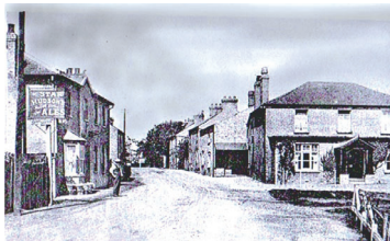
On the left The Star, Station Road