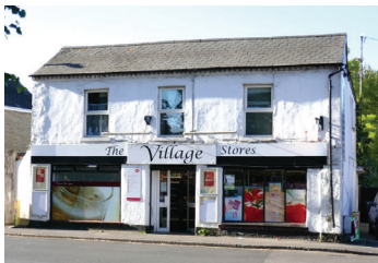
Village Stores - 2018