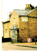
Lloyds Bank 1998

11 Chapel Street Bible study hall. Later a post office, then Lloyds Bank. Now a private residence.