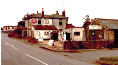
The Railway Tavern/French's Garage, Station Road - 1984