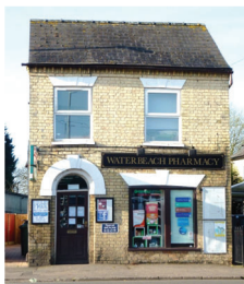
Pharmacy - 2017