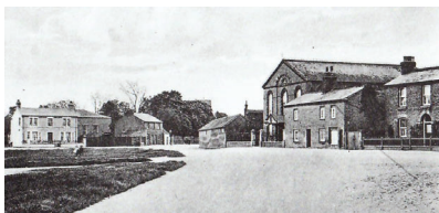
Chapel Street - previously known as Sun Street

Cudworth's hairdressing shop. Then George Nice's cycle shop and car repairs.