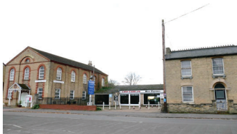
Chapel Street 2018