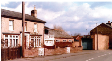
Benton's Bakery 1986

Site of 29a Station Road Mr. Billett's bakery. Later to become Benton's bakery. They delivered bread and "fancies" to neighbouring villages and sold their goods from the property next door (No.29).