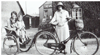
Salvation Army Hall in background