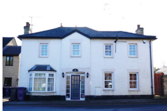
Former Star public house - 2018