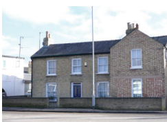
Former Lloyds Bank - 2018